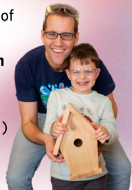
Proud students from a recent adult-and-child woodworking class.